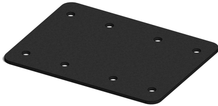
(2) Ganging Plates